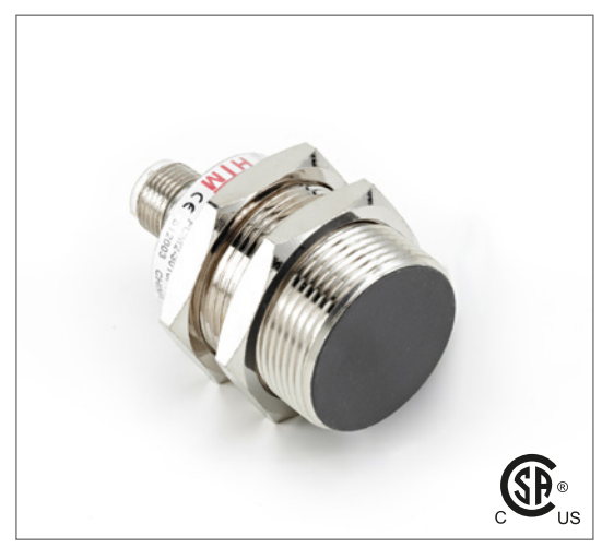
Note: The product images shown may change over time as products are updated.