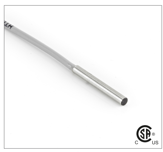
Note: The product images shown may change over time as products are updated.