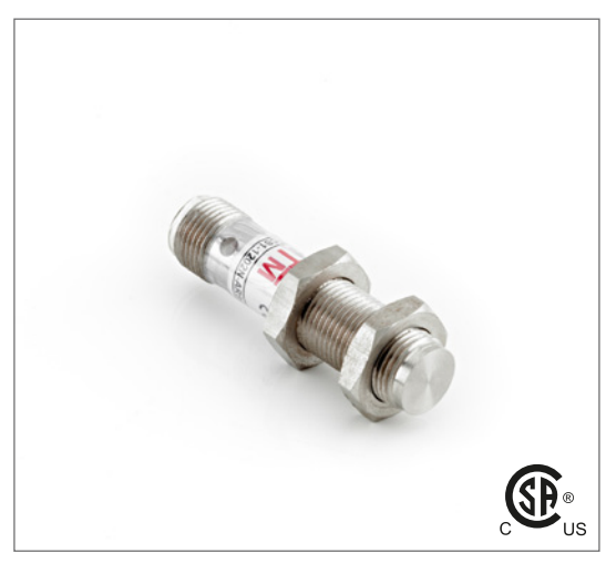
Note: The product images shown may change over time as products are updated.