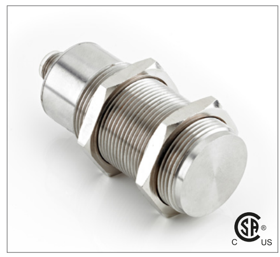
Note: The product images shown may change over time as products are updated.