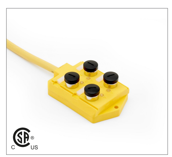
Note: The product images shown may change over time as products are updated.