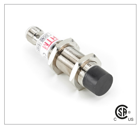
Note: The product images shown may change over time as products are updated.