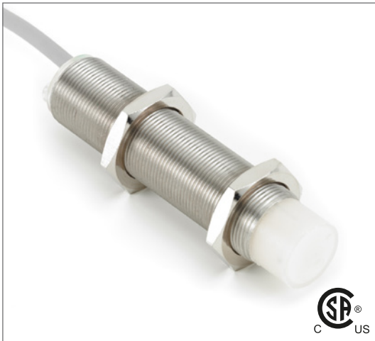
Note: The product images shown may change over time as products are updated.