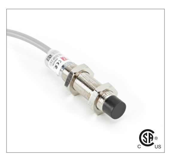
Note: The product images shown may change over time as products are updated.